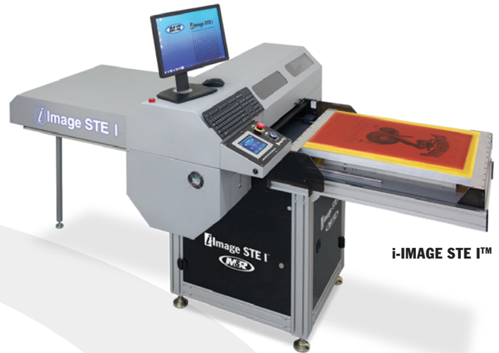
i-IMAGE STE I™

The i-Image STE I is M&R's high-speed imaging-exposure system. It is available in two sizes, with maximum frame sizes of 66 x 91 cm (26" x 36") or 66 x 109 cm (26" x 43"). Both models support either one, two or three printhead configurations. Imaging and exposure are amazingly fast—one-printhead i-Image STE I systems can image and expose up to 150 screens per 8-hour shift; two-printhead models can image and expose up to 300 screens per shift; and three-printhead models can image and expose up to 400 screens per shift*. In fact, three-printhead models can generate and expose full-size images in less than a minute. The i-Image STE I is designed to fit through an 81 cm (32") doorway, and comes complete with a computer, monitor, and proprietary software that gives operators complete control of all print parameters.