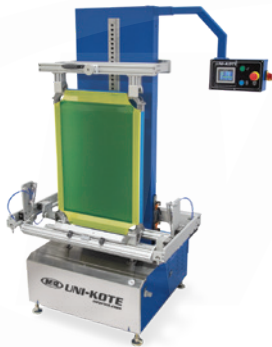
1 Coat Screens with Uni-Kote™ Automatic Screen Coating Machine

Fast, high-quality screen printing starts with high-quality screens, and M&R's Digital Screen Room concept is dedicated to dramatically reducing screen production time while making substantial improvements to image quality and consistency.