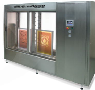
3 Rinse Exposed Screens with Eco-Rinse™ Automatic Screen Rinsing System