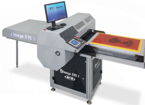
2 Image & Expose Screens with i-Image STE I CTS Imaging & Exposure System