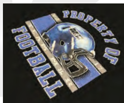
Digital Printed Colors