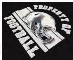
Screen Printed Underbase