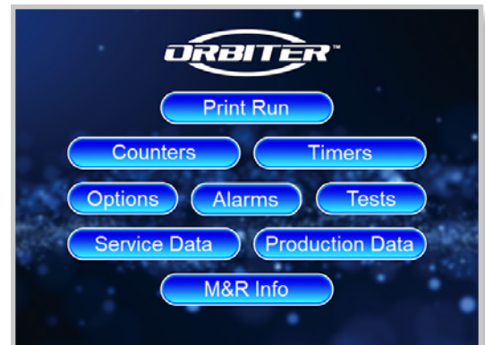
User-friendly touchscreen HMI provides ease of use